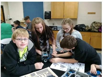
The 4-H After-School Robotics Club in Iosco County received a $1,000 Michigan 4-H Legacy Grant to use VEX Robotics as a tool to help club members develop life skills.

Awarded annually, the Michigan 4-H Foundation recently opened their grant and award opportunities for the 2021-2022 season. Open to 4-H volunteer leaders, members and staff, the grants and awards support local 4-H clubs and county programs, as well as recognize members of the 4-H community. All applications are due June 1.